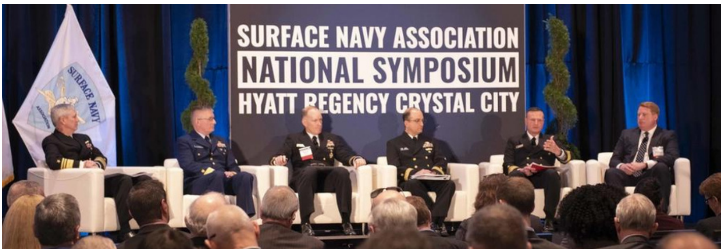
2022 Surface Navy Association's conference

Please be a recruiter for AUSN by sharing AUSN with fellow sea service colleagues, friends and family. Signing up is quick and easy right on AUSN.org .