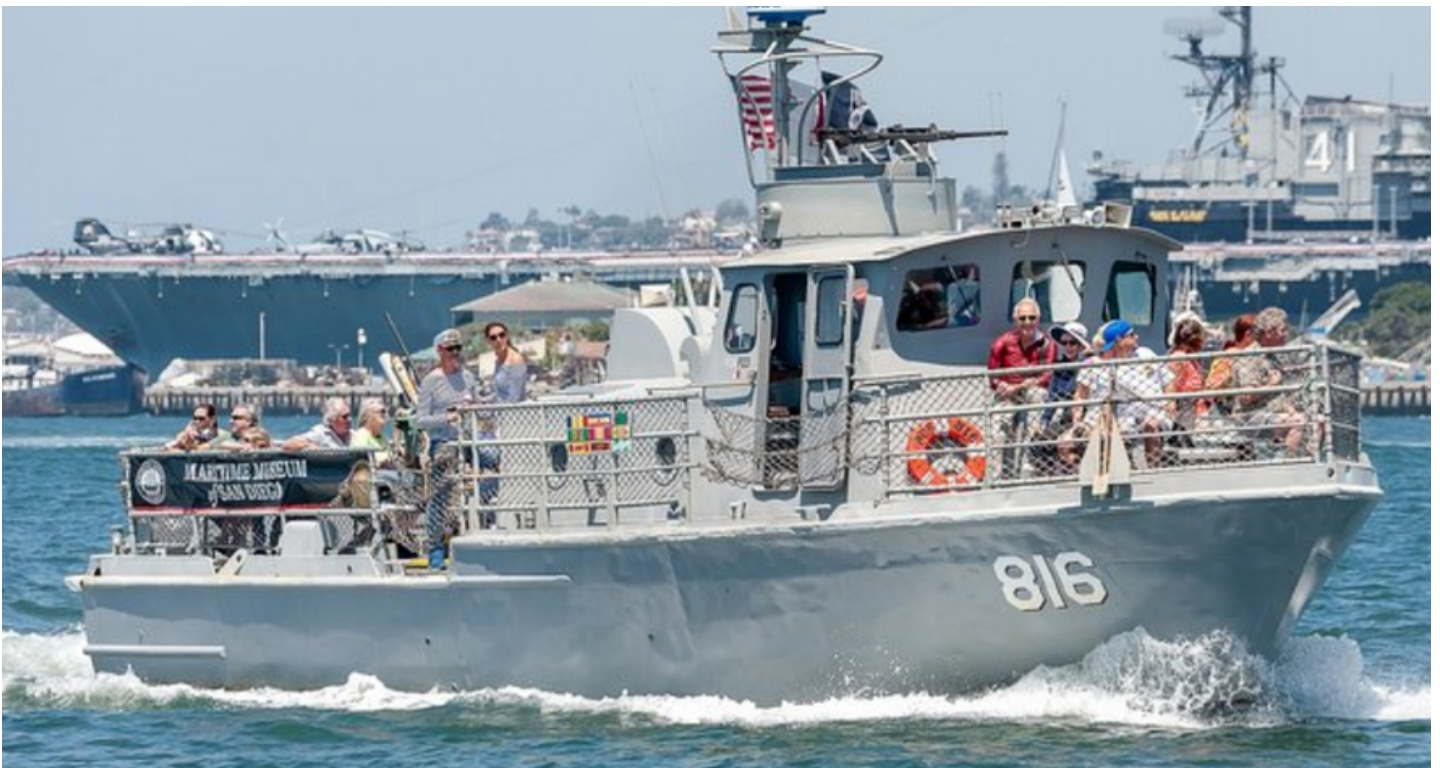
Swift Boat PCF-816 - Maritime Museum of San Diego

I believe that the Swift Boat is important as it tells the story of the Navy's operations in Vietnam to those who didn't serve in that conflict and to those who came after us. As a volunteer aboard her twice daily harbor cruises on the weekends, I have seen firsthand how it provides some amount of closure to the Vietnam vets who ride her. She also serves as a memorial to not only the more than 3,000 American sailors serving in Swift Boats, but also the 50 sailors who were killed in action. Every Vietnam veteran who comes aboard is recognized, given a handshake and a "Welcome Home."