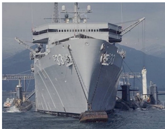
USS SIMON LAKE (AS 33)